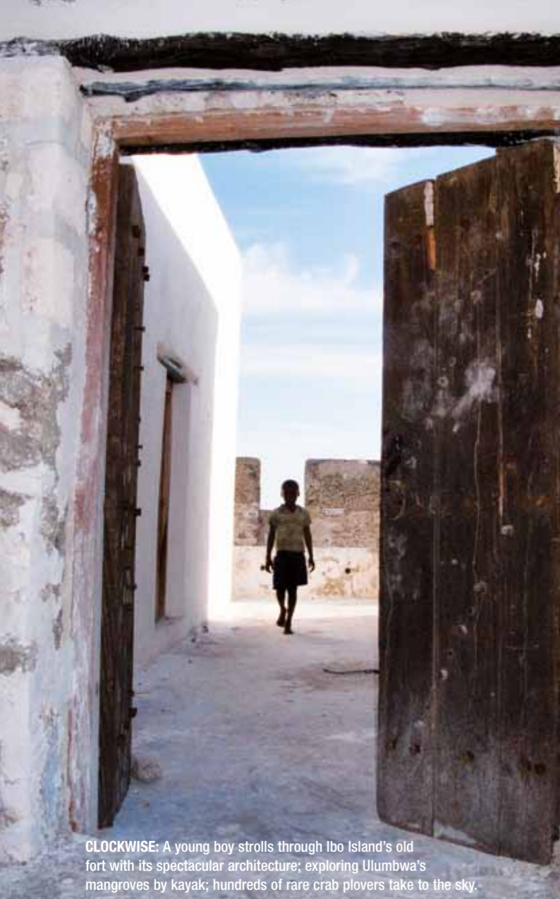
CLOCKWISE: A young boy strolls through Ibo Island's old fort with its spectacular architecture; exploring Ulumbwa's mangroves by kayak; hundreds of rare crab plovers take to the sky.